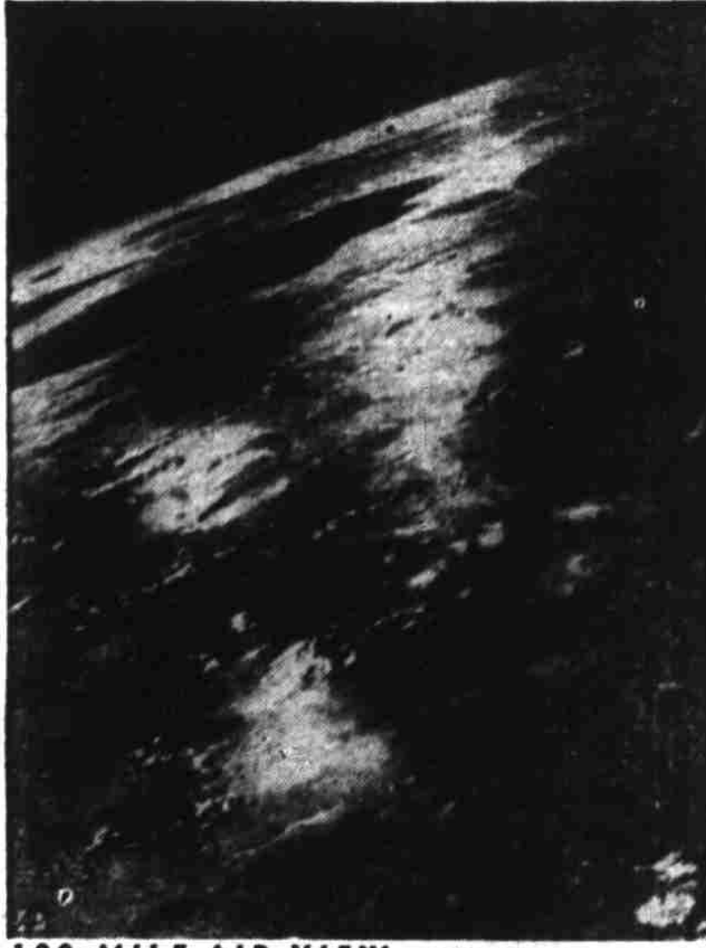
100-MILE AIR VIEW — This Navy photo made by an automatic camera in a V-2 rocket 100 miles above White Sands, N. M., shows more than 200,000 square miles of U. S. and Mexico. Dark finger (upper left) is Gulf of California.