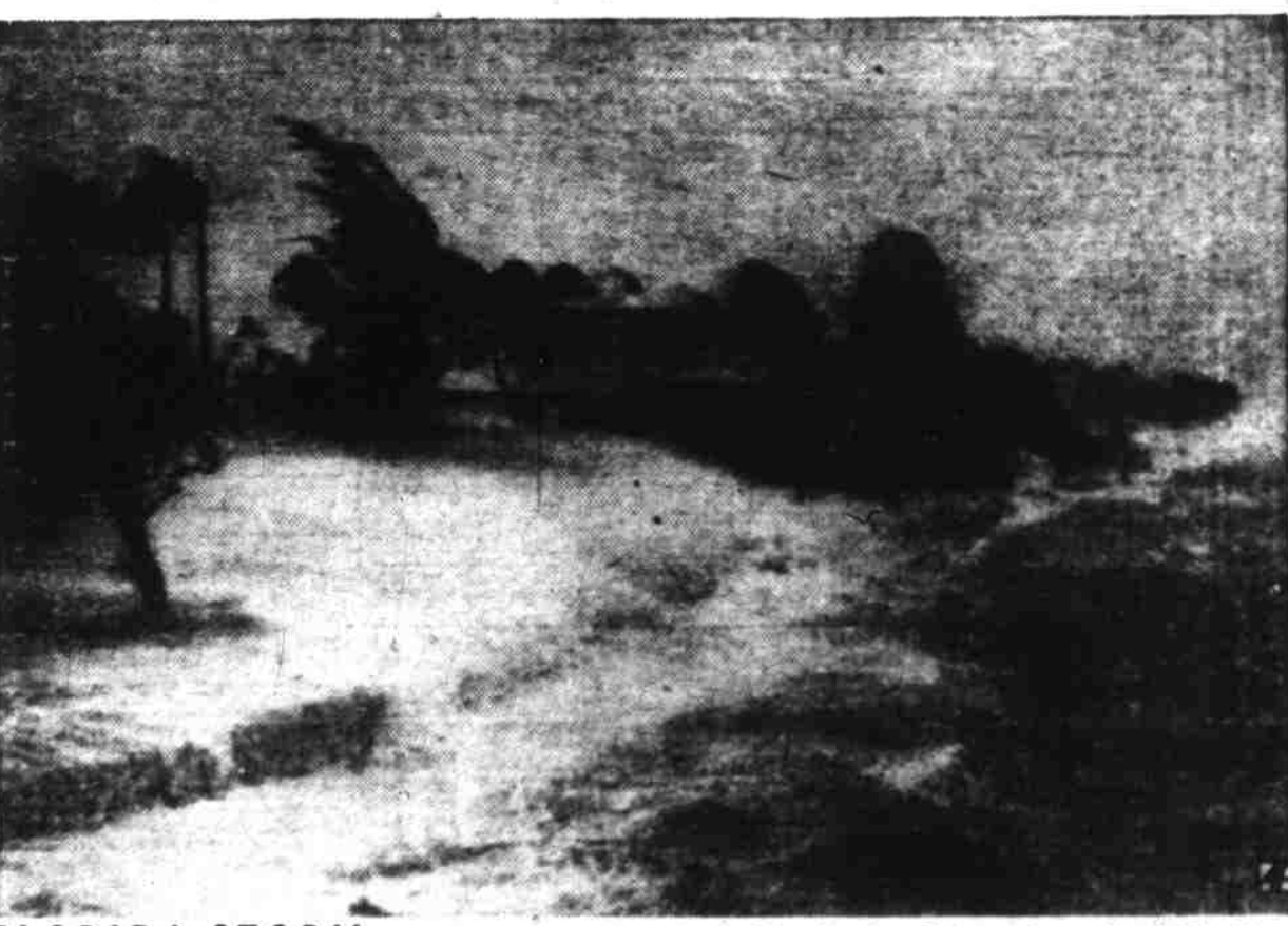
FLORIDA STORM — A September storm brought extensive damage to parts of Florida, especially in the Miami Beach area (above) where high seas pounded waterfront homes.