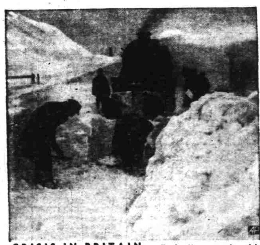
CRISIS IN BRITAIN — England's economic crisis made 1947 headlines. Among contributing factors was the worst blizzard in 50 years, halting fuel transport and killing livestock. This scene is in Yorkshire.