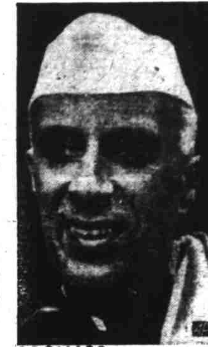
PREMIER — To the accompaniment of bloody Arab-Hindu rioting, India was separated from Pakistan and achieved dominion status in 1947. As the new government was formed, Pandit Jawaharial Nehru (above) became India's prime minister.