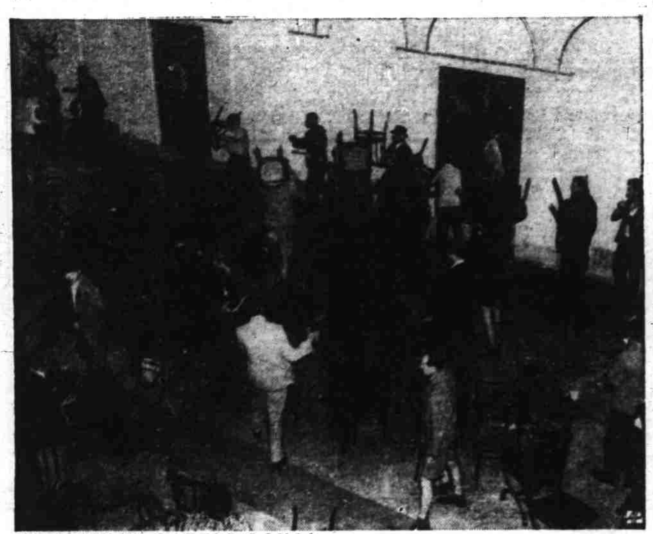
HUNGARIAN BATTLE-ROYAL __ 1947 zaw Communist-dominated governments take over much of Balkans. Here Communists break up a freedom party meeting in Szeged, Hungary.