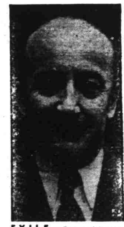
EXILE — Communists came into power in Hungary, compelling Prime Minister Ferenc Nagy (above) to resign and leave the country. Exile of Nagy, who came to the U.S., was assured by holding his son as hostage until he agreed.