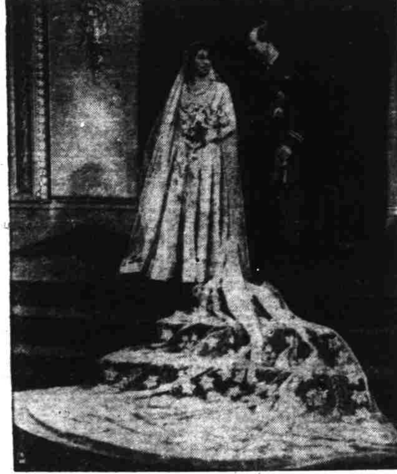
ROYAL NEWLYWEDS — Princess Elizabeth of England and her bridegroom, Prince Philip, Duke of Edinburgh, posed for this picture in Buckingham Palace after their return from their wedding in Westminster Abbey, Nov. 20.