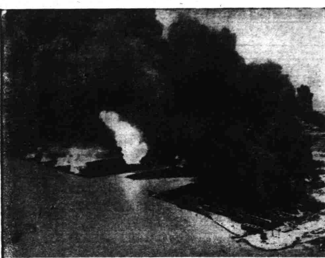
TEXAS CITY HÔLOCAUST — This spectacular fire, set off by explosion of French ship Grandcamp on the Texas City, Tex., waterfront April 16, brought death to 468, injured 3,000.