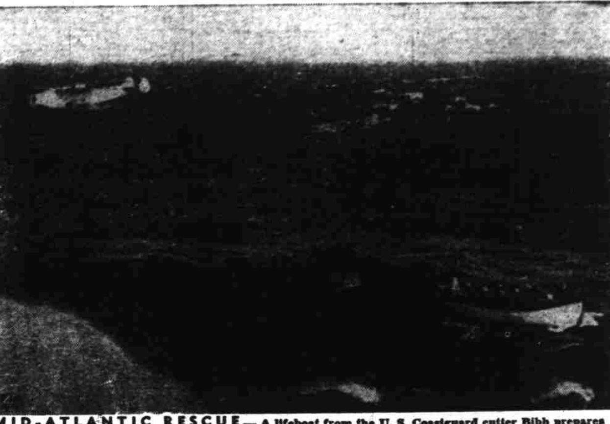
MID-ATLANTIC RESCUE ... A lifeboat from the U. S. Coasignard cutter Bibb prepares to take off 69 persons aboard the flying boat Bermuda Sky Queen, forced down in mid-Atlantic.