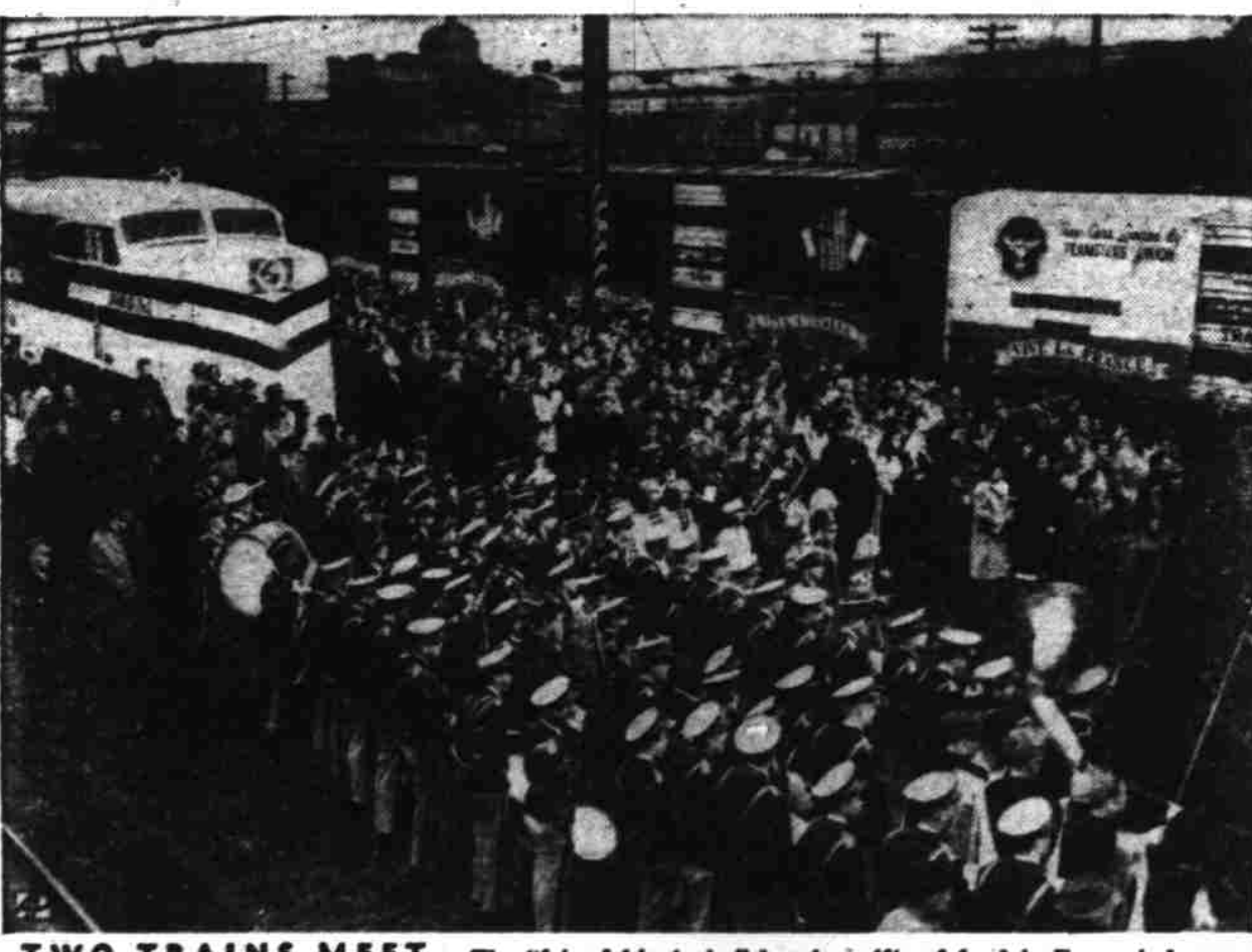
TWO TRAINS MEET - The "friendship train," bearing gifts of food to Europe's hungry, and the "freedom train," touring the U. S. with historic documents, meet at Harrisburg, Pa.