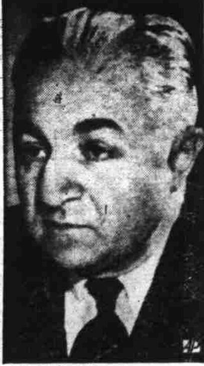
HANGED—Despite strenuous protests from the U.S. and England, Nikola Petkov, (above) leader of the Bulgarian peasant party, was convicted and hanged on charges of conspiring against the country's Communist-dominated government.