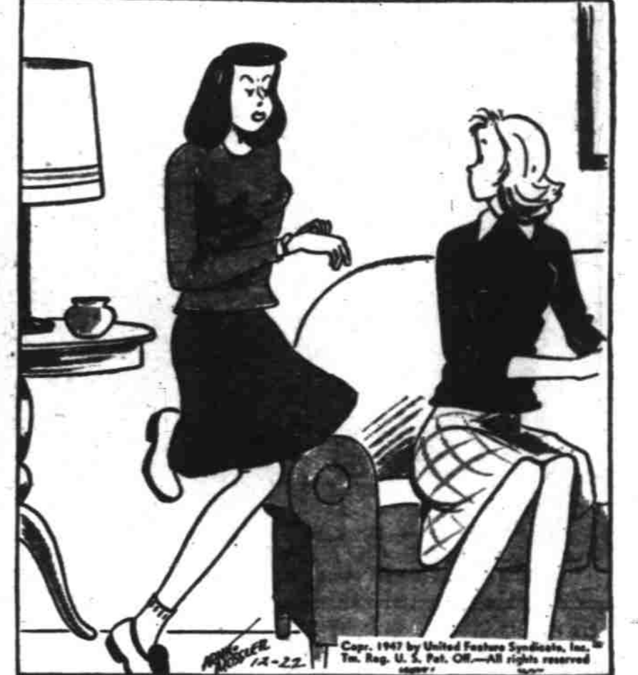
"Buford's three hours late for our date now... If he doesn't come in exactly five minutes, I'll stand him up!"