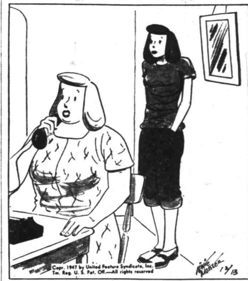
'You'll have to send a repair man tonight . . . my daughter has exams tomorrow and she can't study without the radio!"

some at new 1947 highs, were The Statesman, Salem, Ore., Saturday, December 13, 1947-7 Phillips Petroleum 57%, Pure Oil "THE YOUNG IDEA"