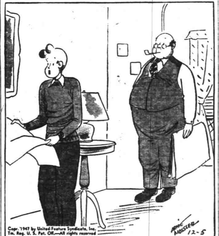
"With things in such a mess, sometimes I wish approaching manhood were a little farther off!"

NOTICE OF FINAL HEARING Notice is hereby given that the un-dersigned Executrix has filed her Final Account and Report in the Circuit Court of the State of Oregon for Marion County, in Probate, and that Mon-day, the 8th day of December, 1947, at 10.00 o'clock A.M. at the Circuit Court room in the courthouse in Salem, Ore-gon, has been set as the time and