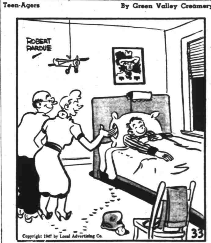
Junior must be dreaming of GREEN VALLEY ICE CREAM again.