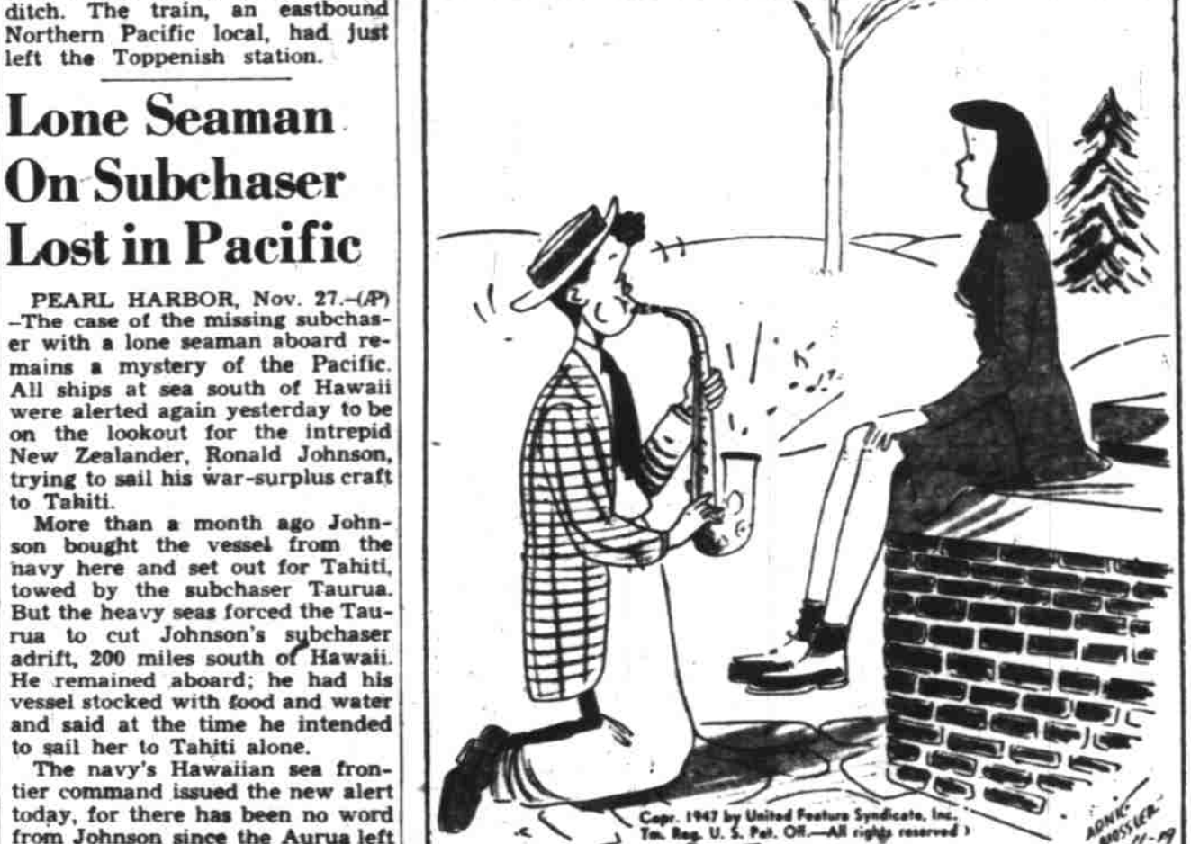
doesn't establish the same