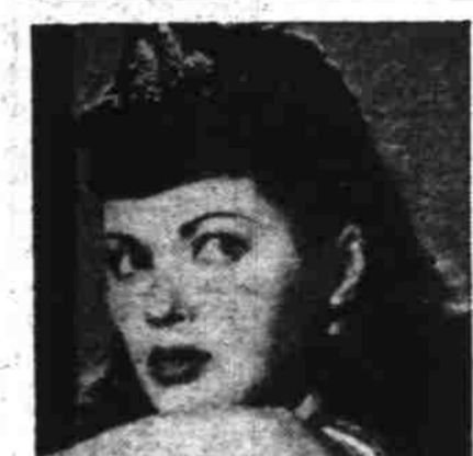
Yvonne De Carlo, co-starred with George Brent in the technicolor adventure "Slave Girl," now at the Grand.

Roller Skating This Afternoon From 2 to 4 P. M. CAPITOLA ROLLER RINK