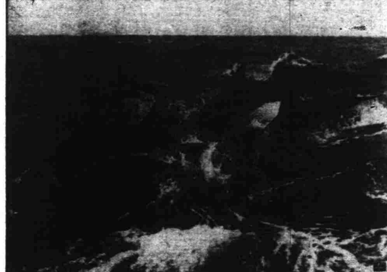
PLAYFUL PORPOISES — A school of porpoises playing tag with a boat off Southport, N. C., were caught by a photographer in this unusual closeup.