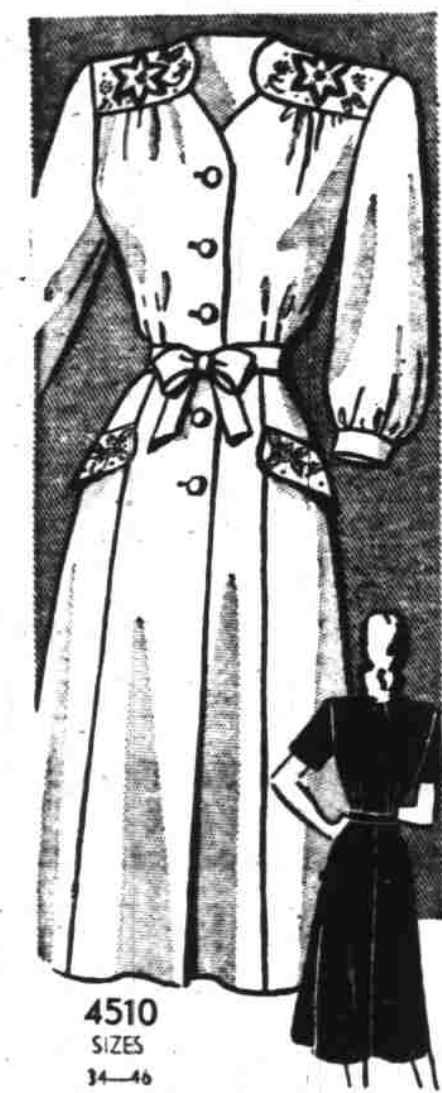
4510 SIZES 34-46

Look this way please! It's the way you look! Look! Pattern 4510 flatters your figure with new slim lines, smart details. Touches of easy embroidery finish it perfectly. This pattern, easy to use, simple to sew, is tested for fit. Includes complete illustrated instructions.