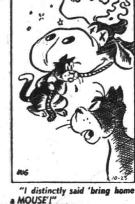
"I distinctly said 'bring home a MOUSE!'"