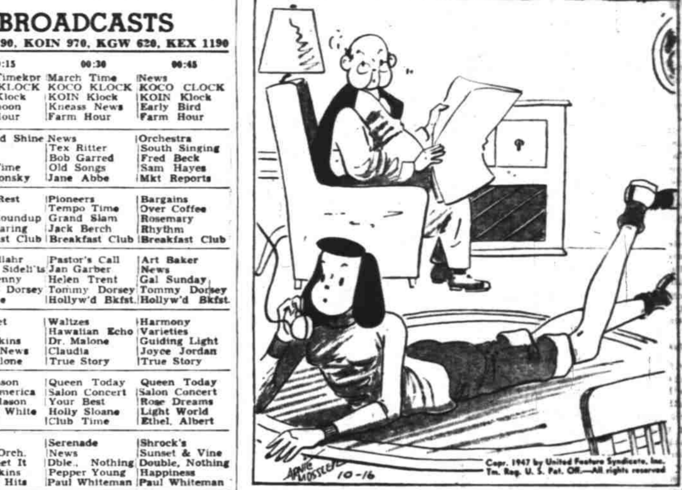
"Okay, I'll call Pop to the phone, Mr. Simon, but cut it short, will ya? ... I'm expecting a bus from a super-drooley dream man."