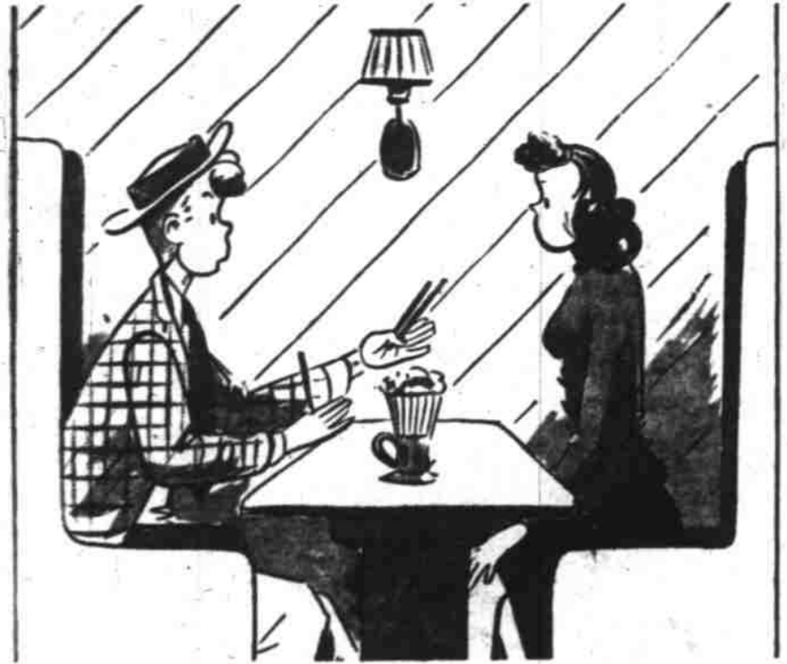
"Just to prove how I feel about you Beverly, you use two straws and I'll use only one!"