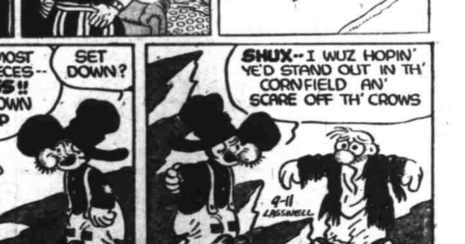
THOSE ROCKS ALMOST RIPPED ME TO PIECES—WHEN MY LEGS!

mostly steady, extreme top 25 cents higher at 31.75 for 9 head, a new high; bulk good-choice 180-200 lbs 31.50; 250-300 lbs 28.50-29.75; good 145 lbs 28.50; good 550-600 lb sows 23.25; lighter weights 24.00-30; good stags 29.00; 1 lot good-choice 71 lb feeder pigs 23.00. Salable and total sheep 700; market