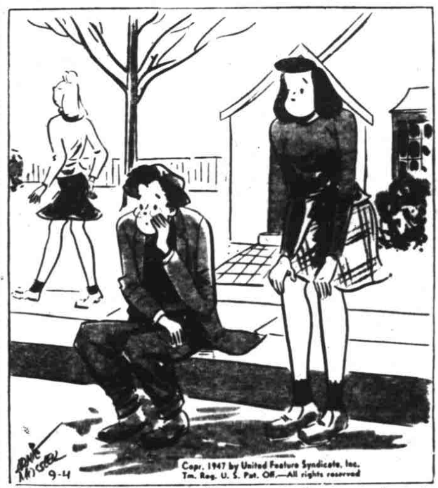
Don't feel badly, Harvey... I'd marry you, if you were the last man on earth!