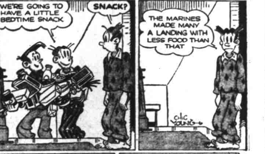
WE'RE GOING TO HAVE A LITTLE BEDTIME SNACK