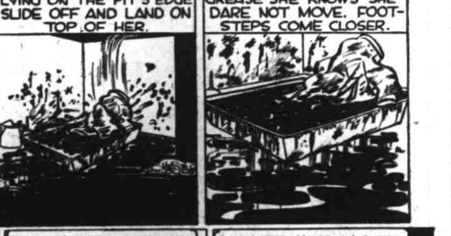
IN SPITE OF THE SLIMY GREASE SHE KNOWS SHE DARE NOT MOVE, FOOTSTEPS COME CLOSER.