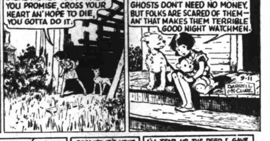
A HAUNTED HOUSE IS A SWELL PLACE TO HIDE MONEY, 'CAUSE GHOSTS DON'T NEED NO MONEY, BUT FOLKS ARE SCARED OF THEM—AN' THAT MAKES THEM TERRIBLE GOOD NIGHT WATCHMEN.