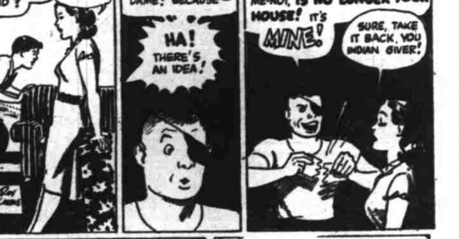
HA! THERE'S AN IDEA!