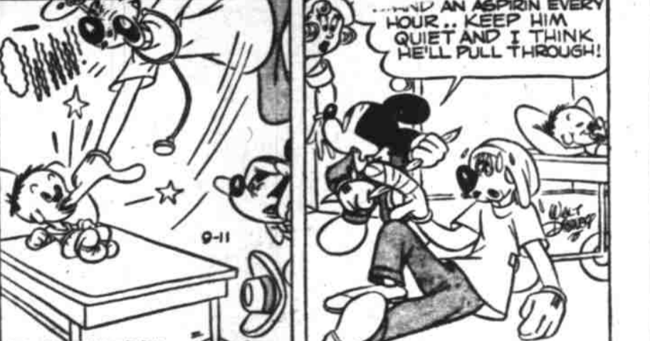
WATCH IT, DOC!