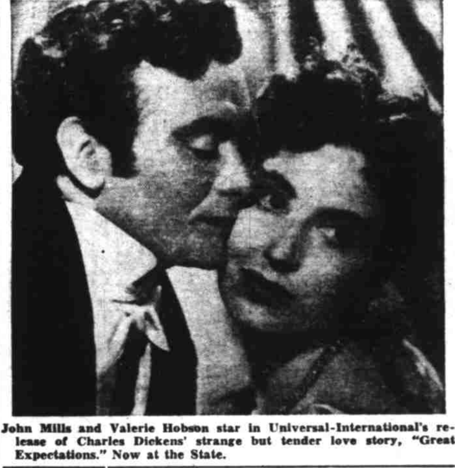
John Mills and Valerie Hobson star in Universal-International's release of Charles Dickens' strange but tender love story, 'Great Expectations.' Now at the State.

mostly steady, extreme top 25 cents higher at 31.75 for 9 head, a new high; bulk good-choice 180-200 lbs 31.50; 250-300 lbs 28.50-29.75; good 145 lbs 28.50; good 550-600 lb sows 23.25; lighter weights 24.00-30; good stags 29.00; 1 lot good-choice 71 lb feeder pigs 23.00. Salable and total sheep 700; market