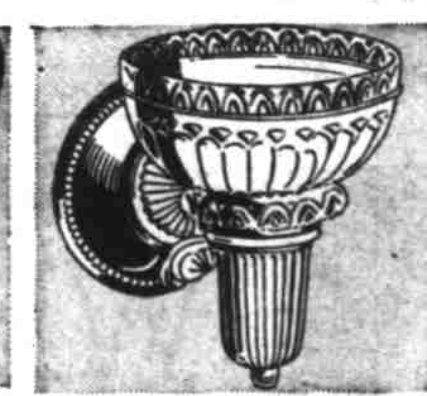
Homart Wall Unit

Newest Style A handsome, modern wall bracket that spreads glareless, soft light. Wedgewood Blue and White. Underwriters' Approved.