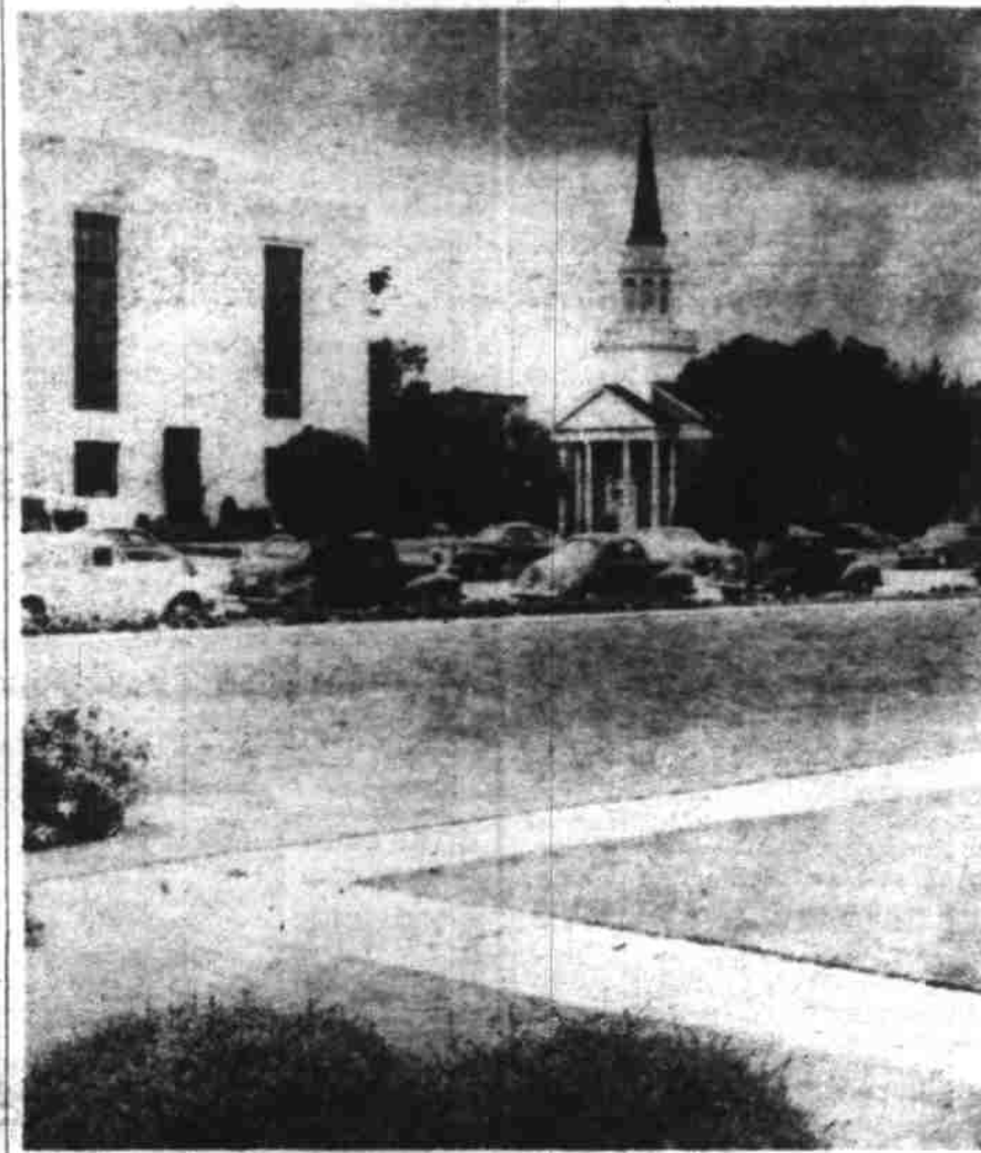
The state highway commission, in need of a new office building in Salem, is considering the purchase of the block which is the attractive site of the First Presbyterian church...