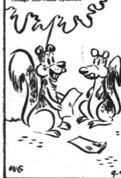
"It says, 'Nuts to you.' How nice."