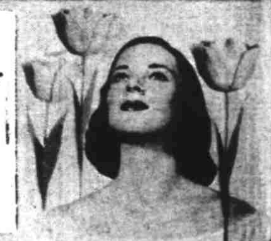
HELPS RESTORE SPRING FLOWER BEAUTY TO FADING SKIN

"I'm ten years older than my employer thinks I am"