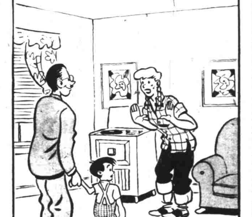
'Oh. I'll sit with him tonight for nothing since you have lots of GREEN VALLEY ICE CREAM."

day, 7:30 p.m. Midweek Bible study