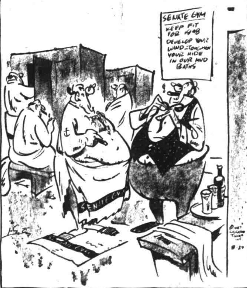
"Why should the Russians distrust our form of government-it isn't in the nary civil rights and deny to in- as if they were constituents and we made campaign promises to

SENATE GYM EDR 1948 DEVELOP YOU? WIND TOWNER IN OUR MUD BATHS