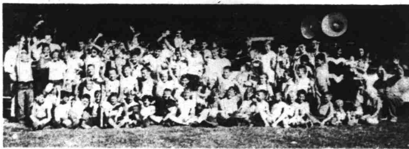
These approximately 85 youngsters are enthusiastic Statesman carriers, pictured at a picnic-outing sponsored Tuesday by The Statesman circulation staff at Paradise Island. After their "feed," ball games, races and swimming, the boys attended a local theatre in a group.