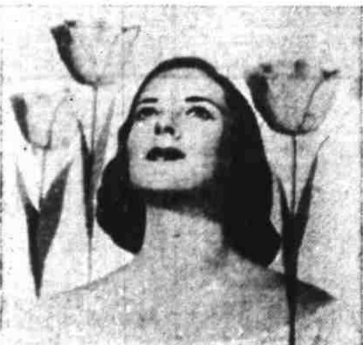
HELPS RESTORE SPRING FLOWER BEAUTY TO FADING SKIN

"Friends wonder how I stay looking so young"