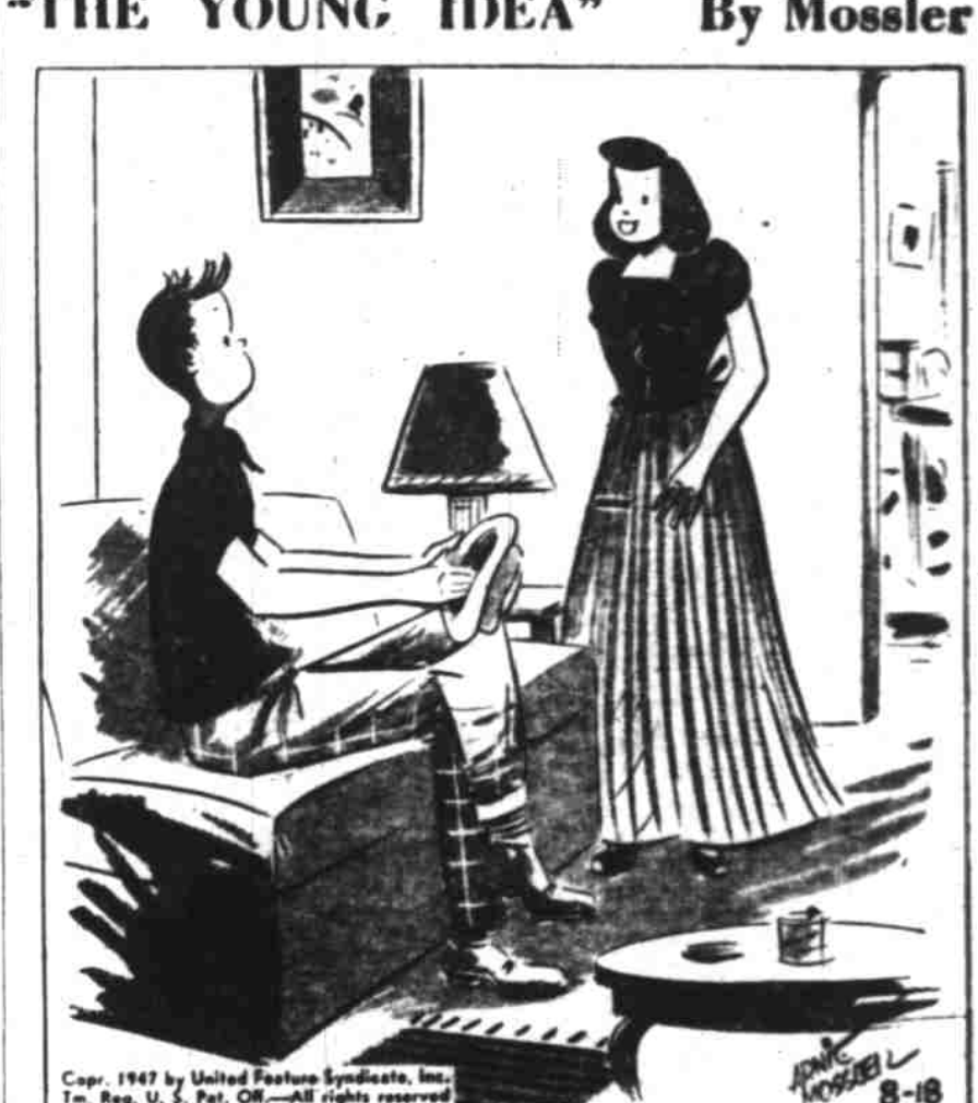
Cap. 1947 by United Feature Syndicate, Inc. Re. Reg. U. S. Pat. Off.—All rights reserved.

"I hope you won't mind my wearing my new formal, Rodney... I want to break it in for the party Saturday night!"