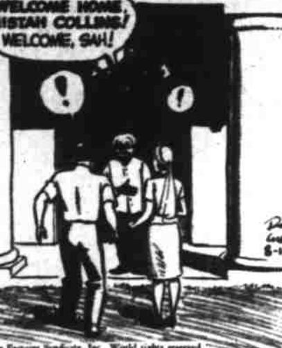
IT'S ALL JUST AS I DREAMED IT WOULD BE, EXCEPT... THAT YOU DENY YOU'RE THIRSTY COLLINS.