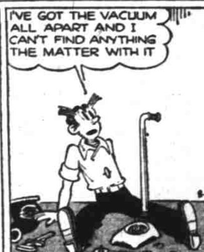
I'VE GOT THE VACUUM ALL APART AND I CAN'T FIND ANYTHING THE MATTER WITH IT