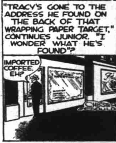
"TRACY'S GONE TO THE ADDRESS HE FOUND ON THE BACK OF THAT WRAPPING PAPER TARGET," CONTINUES JUNIOR. "I WONDER WHAT HE'S FOUND?"