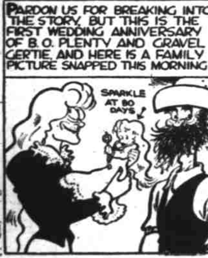
PARDON US FOR BREAKING INTO THE STORY, BUT THIS IS THE FIRST WEDDING ANNIVERSARY OF B.O. PLENTY AND GRAVEL CERTIE AND HERE IS A FAMILY PICTURE SNAPPED THIS MORNING.