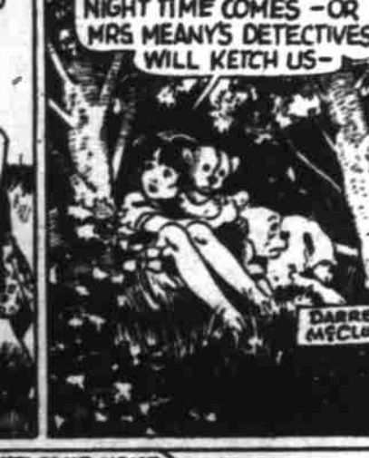
WE GOTTA HIDE UNTIL NIGHT TIME COMES OR MRS. MEANY'S DETECTIVES WILL KETCH US—