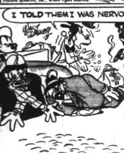
I TOLD THEM I WAS NERVOUS!