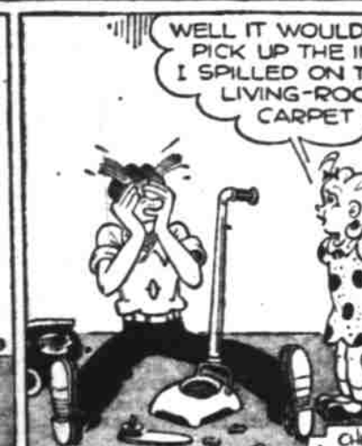
WELL, IT WOULDN'T PICK UP THE INK I SPILLED ON THE LIVING-Room CARPET