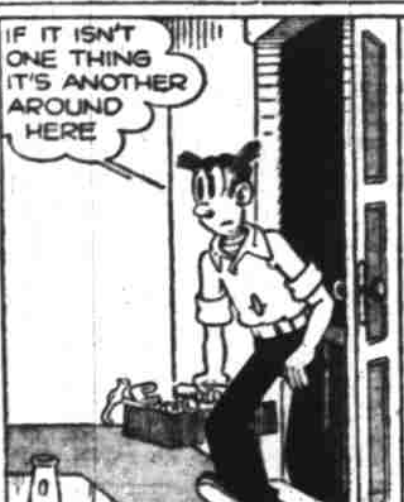
IF IT ISN'T ONE THING IT'S ANOTHER AROUND HERE