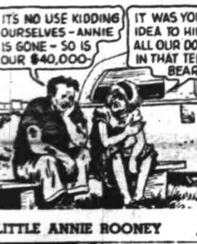
LITTLE ANNIE ROONEY