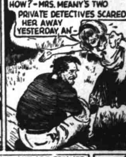
SURE—FIND THE KID—WHERE? HOW?—MRS. MEANY'S TWO PRIVATE DETECTIVES SCARED HER AWAY YESTERDAY AN—