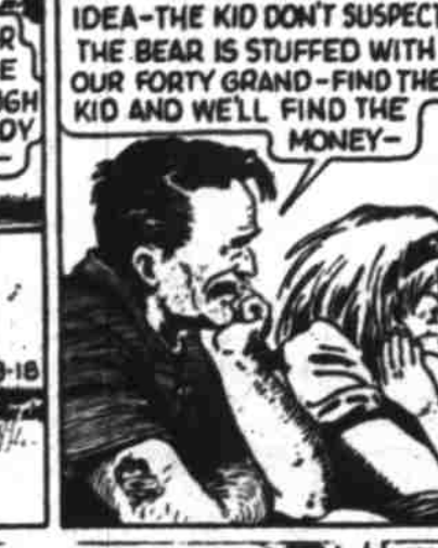
IT WAS AND STILL IS A GOOD IDEA—THE KID DON'T SUSPECT THE BEAR IS STUFFED WITH OUR FORTY GRAND—FIND THE KID AND WE'LL FIND THE MONEY—