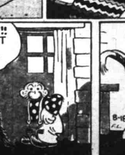
HMMM— LET ME PONDER