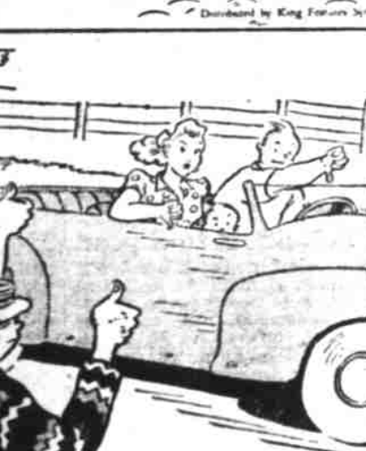
I'LL SAY NOT!