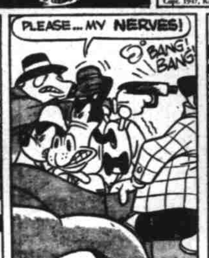
PLEASE... MY NERVES!