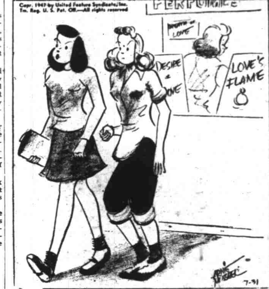
"Fine thing!... Won't sell us any without notes from our mothers!"