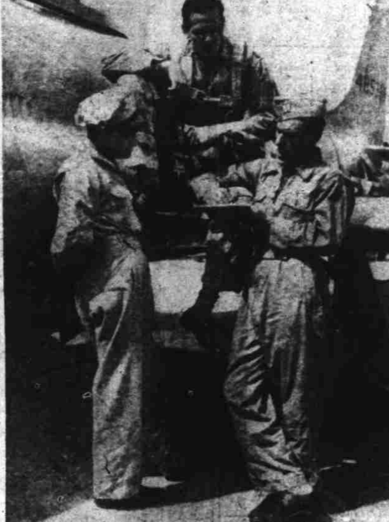
ANDREWS FIELD, Md., Aug. 2—F-59 Shooting Star flyers compare notes after setting unofficial speed records from three cities to Andrews Field, Md., in celebration of air forces 40th anniversary.