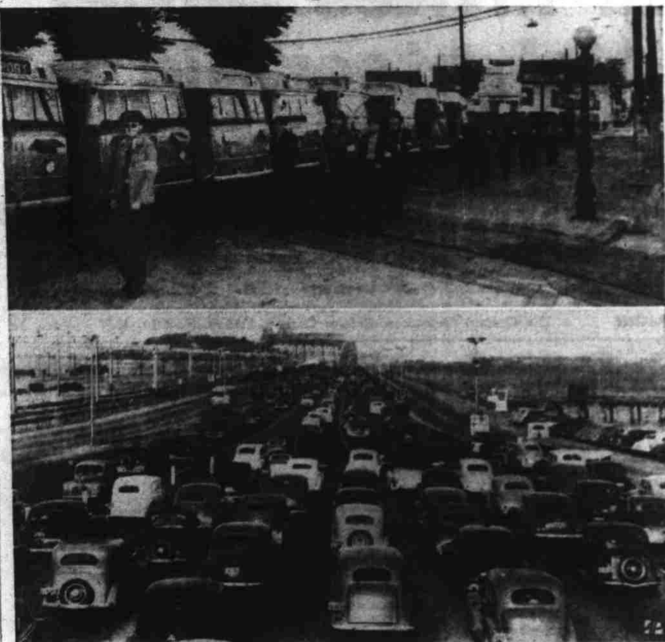
OAKLAND, June 12—Pickets (top) march before idle busses in Oakland, Calif., as the Key System train and bus personnel walk out on strike, leaving an estimated half-million persons without transportation. East bay residents employed in trans-bay San Francisco pooled automobiles and jammed the San Francisco bay bridge (bottom).