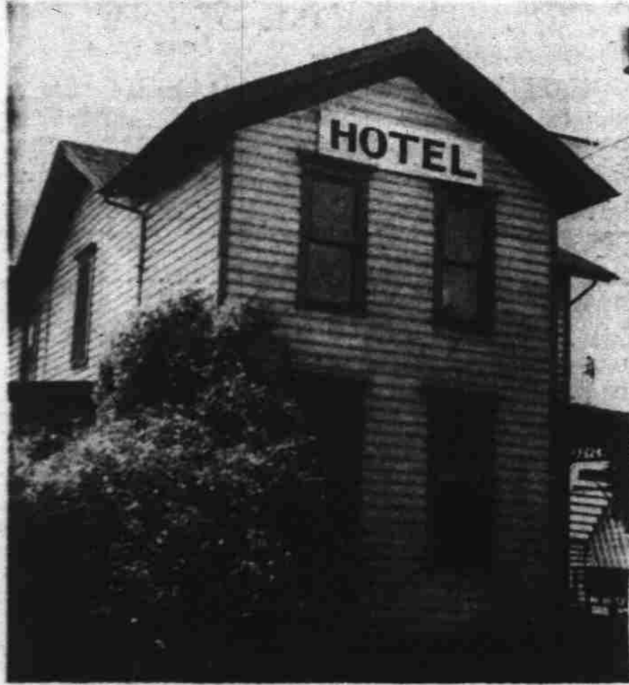
Once this building, at 558 State st., was in the midst of a residential district of Salem, but for several years now it has been surrounded by business buildings, and as a rooming house has become part of the city's expanding business district. Now it is to be razed to make way for a parking lot.