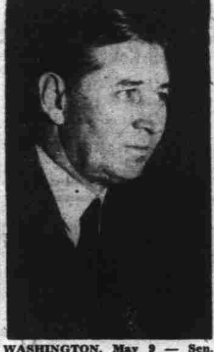
WASHINGTON, May 9 - Sen. James E. Murray (D-Mont.) who introduced a mild labor reform bill in the senate today designed to meet possible ob-jections of President Truman