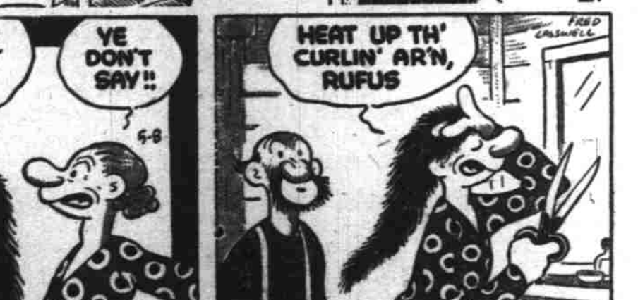
HEAT UP TH' CURLIN' ARN, RUFUS