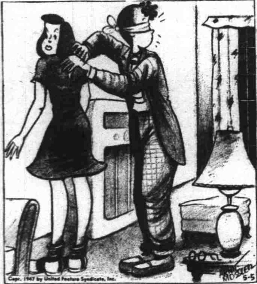
"Frankly, Buford, I think you're making a mountain out of a molehill... just to snap me up!"