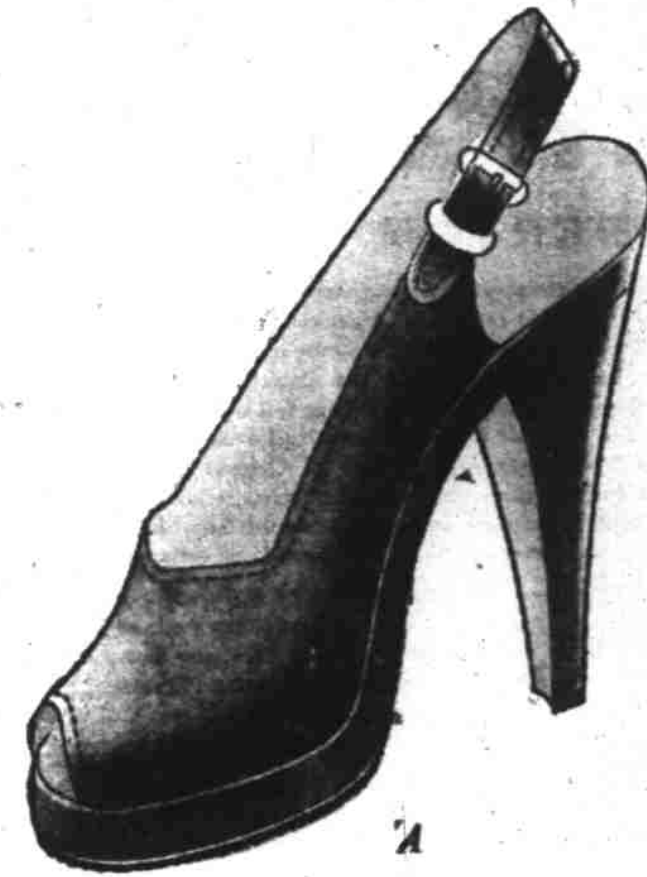
A Striking platform pump in bright red suede! Dressy accent for Easter frocks. Adjustable strap. 4 to 9.