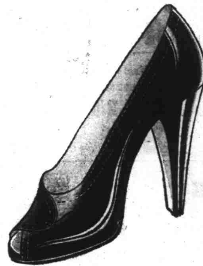
E Smart patent pump in black! Effective stitched detail trim. Equally nice with dresses or suits. 4-9. 5.95