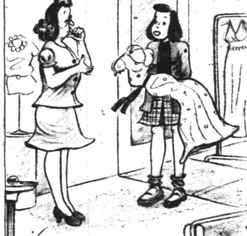
"Could I take it home on approval, till I see if I get a date for the dance?"

EXPERIENCED shipping and receiving clerk. Please apply in person. Interstate Tractor and Equipment Co., 3055 Silverton Road. LOCAL Merchandising firm, substantially in credit business, wishes office man with credit experience. office man with credit experience. Good salary, opportunity for advancement. Write Statesman Box 177. WANTED: Experienced dairyman. Wages $150 per month plus board and room. 6 day week. Rieck Bros., Rt. 5, Box 178. GROCERY Clerk. Saving Center. Portland road. A-1 AUTO Mechanic, steady work, your own boss. 809 Edgewater St., W. Salem.