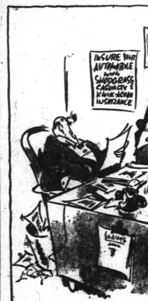
"With so many accidents, we have only two alternatives—either raise the rates on our policies—or slip some jokers into the fireprint!"