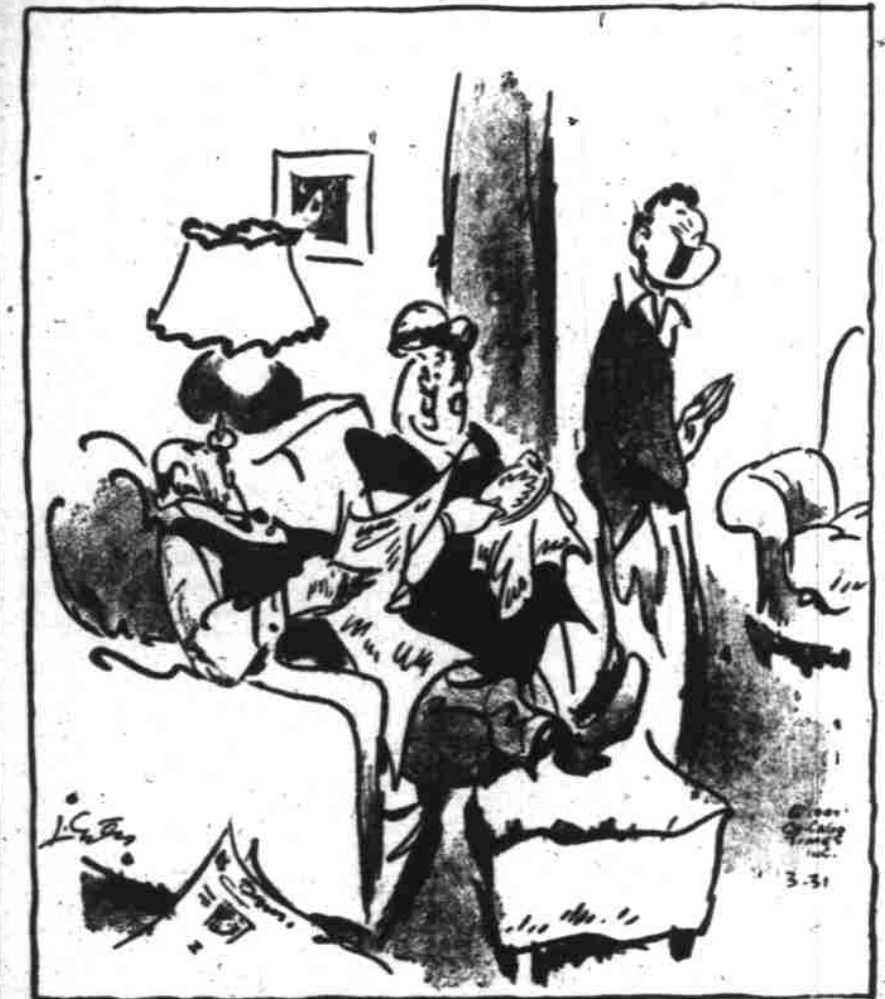
"Politicians, employees and radio announcers show no respect for your intelligence. Otis-why expect it of Junior?"

proposals $246 to settle small claims regarding bounties-election costs. etc. HB 544-(Joint ways, means)-Appropriates $132,238 for prison hospitals, training schools, deaf and blind schools, blind commission, parole staff.