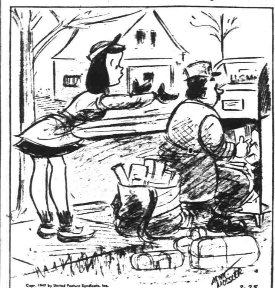
"Cap. 1947 by United Feature Syndicate, Inc. 2-25"

"But I gotta have that letter back, Mr. Durkin—I just found out I must have put Sinatra's letter in Van Johnson's envelope!"