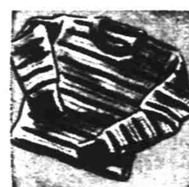
Boys' Polo Shirts

Boys' Sizes 1.59 All wool felt dress hats available in blues and browns. Boys' sizes 6 1/2 to 6 1/2.