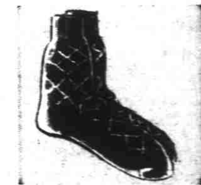
Boys' Crew Sox

Sizes 6 to 16 60c Made of fine, strong broadcloth in assorted patterns. Full elastic waistbands.