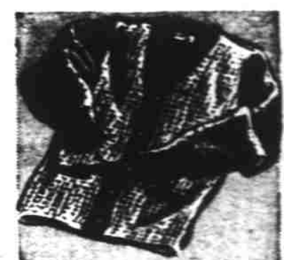
Boys' Coal Sweaters

Sizes 8 to 14 1.10 Long-sleeved, striped polo shirts. Practical and comfortable. Easily laundered.