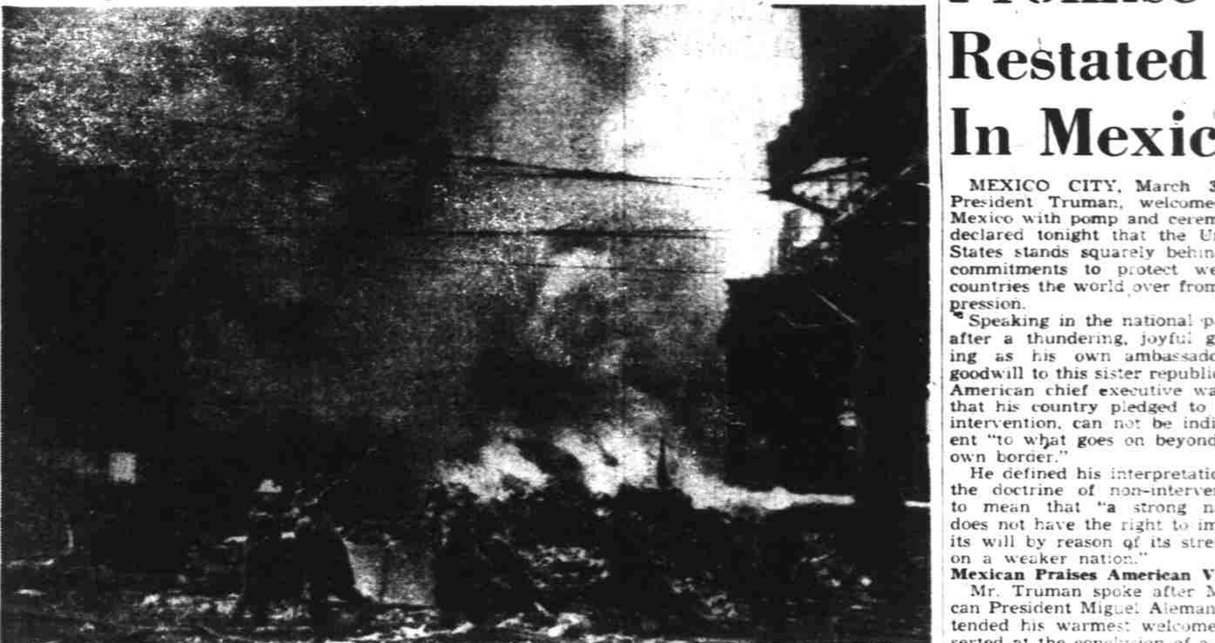
CHICAGO, March 3-(P)-Chicago firemen drag hoses to the smouldering ruins of a building wrecked by an explosion in Chicago's loop. Left background is one of several adjoining buildings damaged, and at right is elevated system, also damaged by the blast, necessitating rerouting of trains. At least cas is heard in the choral strain four persons were killed, it was determined last night when a fourth body was found in the debris. of the countries of the world with