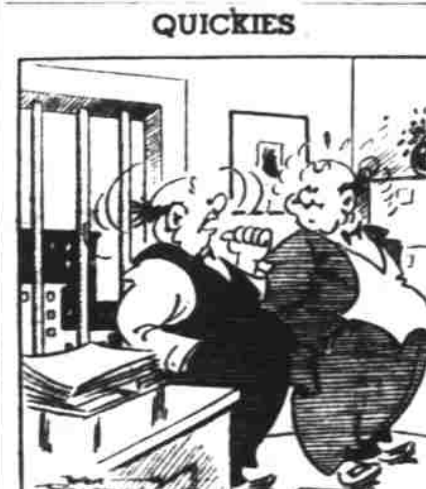
"Well, I'll admit your Statesman. Want Ad said the job was permanent—but must you put bars on all the windows?"