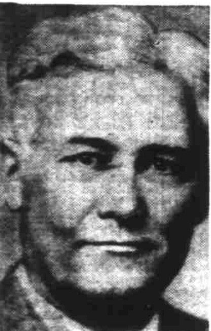
WASHINGTON, Jan. 17—Sen. Hugh Butler (R-Neb.), whose proposal to delay negotiations on trade agreements with foreign countries pending the formation of a new tariff policy by the GOP was rejected today by the state department.