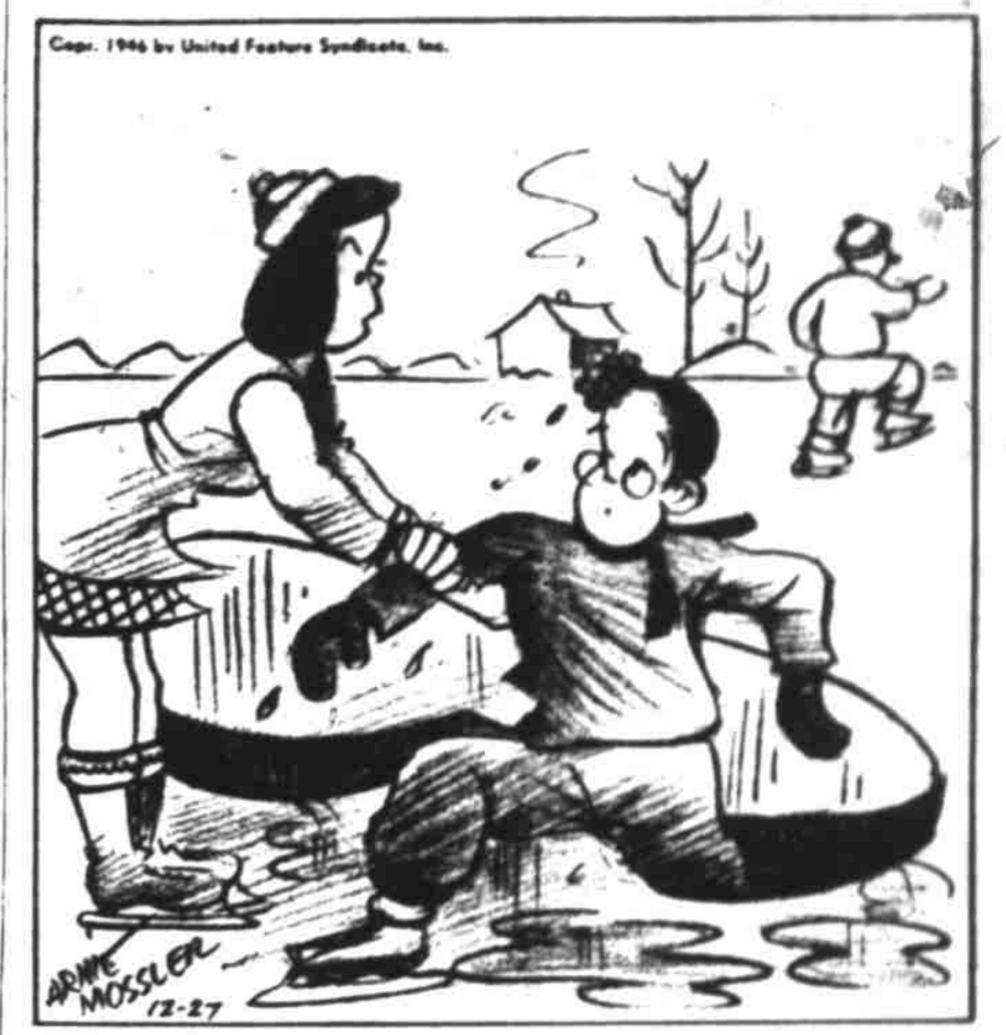
"Why couldn't you have been satisfied with a few figure eights instead of having to make fifty in a row?"