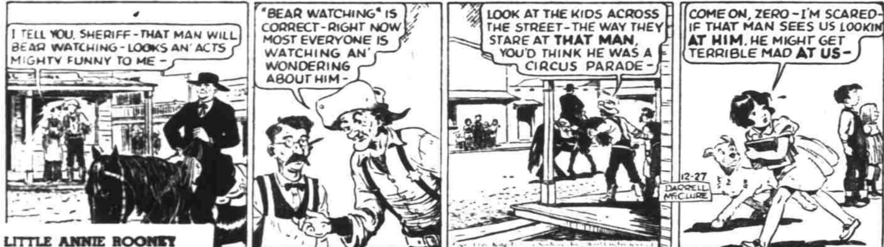
LITTLE ANNIE ROONEY