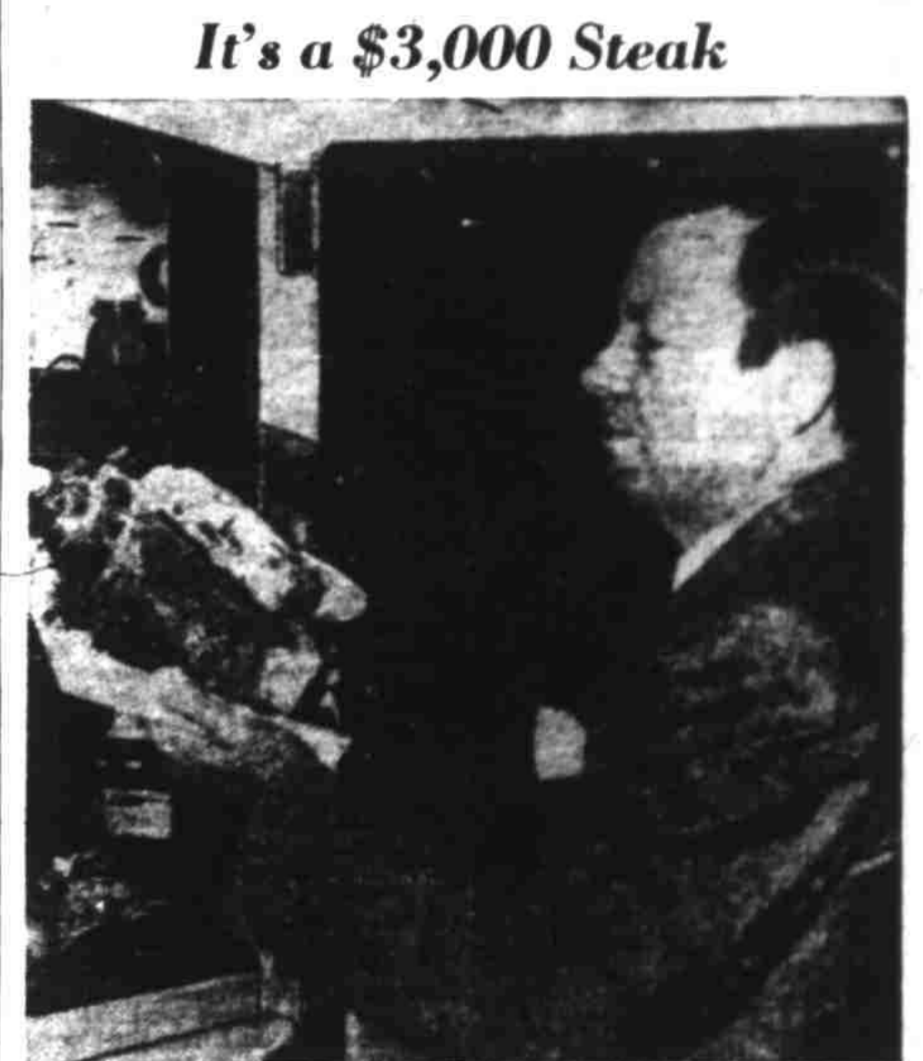
It's a $3,000 Steak