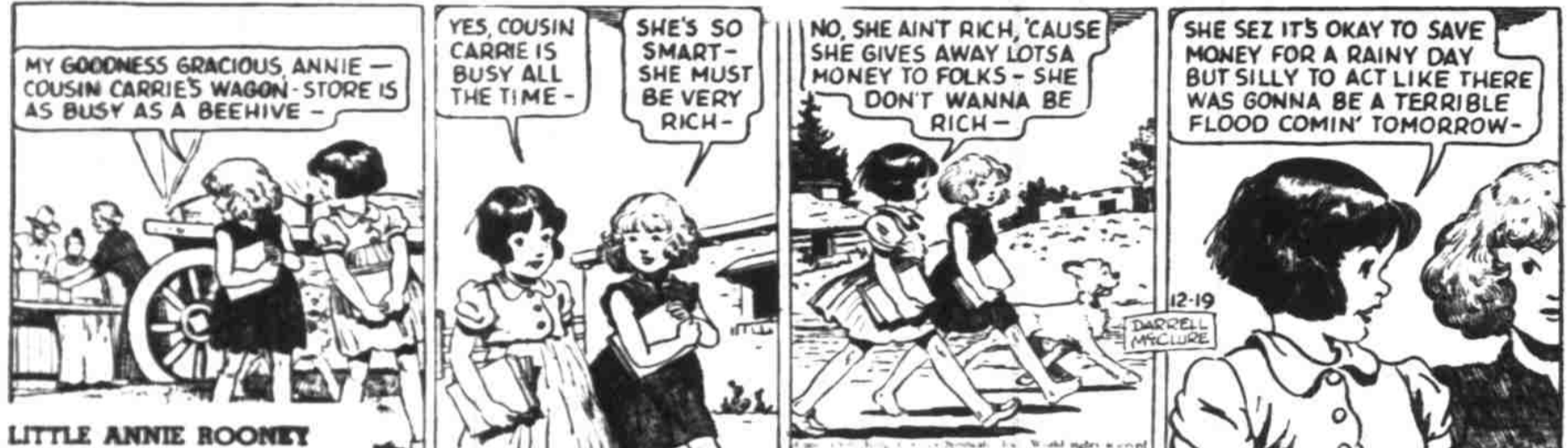
LITTLE ANNIE ROONEY