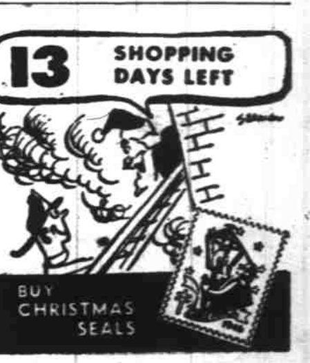
BUY CHRISTMAS SEALS

LAKE SUCCESS, N. Y., Dec. 9.—(AP)—The United Nations permanent site committee confronted with a United States' proposal to postpone selection of a permanent UN home to next year, failed again tonight to reach a vote on the issue which already has been pending more than a year.