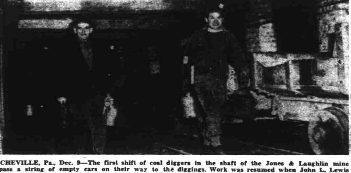
RICHEVILLE, Pa., Dec. 9.—The first shift of coal diggers in the shaft of the Jones & Laughlin mine pass a string of empty cars on their way to the diggings. Work was resumed when John L. Lewis ordered miners back to their jobs.