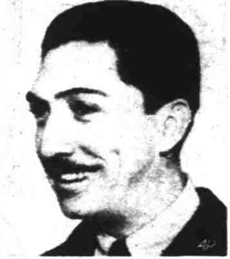
MEXICO CITY, Nov. 30—Miguel Aleman, 43-year-old lawyer and politician, will take office tomorrow as the first civilian president in Mexico's history. He plans a program of industrial development based on private enterprise.