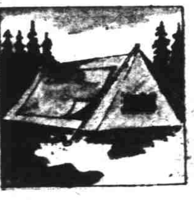
Air Force Pup Tent