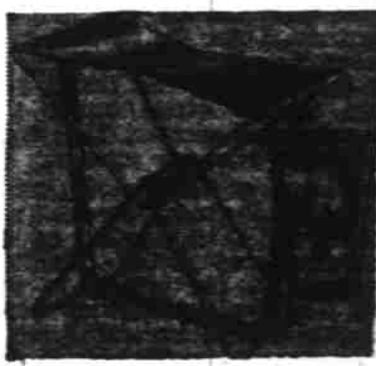
Folding CAMP STOOLS 1.19

Use for sports events and picnics, too! Light-weight, all metal, rust-proofed construc-