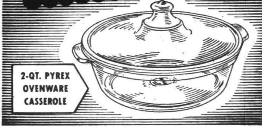
2-QT. PYREX OVENWARE CASSEROLE

PYREX FLAMEWARE 2-QT. SAUCEPAN AND PYREX 2-QT. CASSEROLE ONLY $2.10 With knob cover that fits both