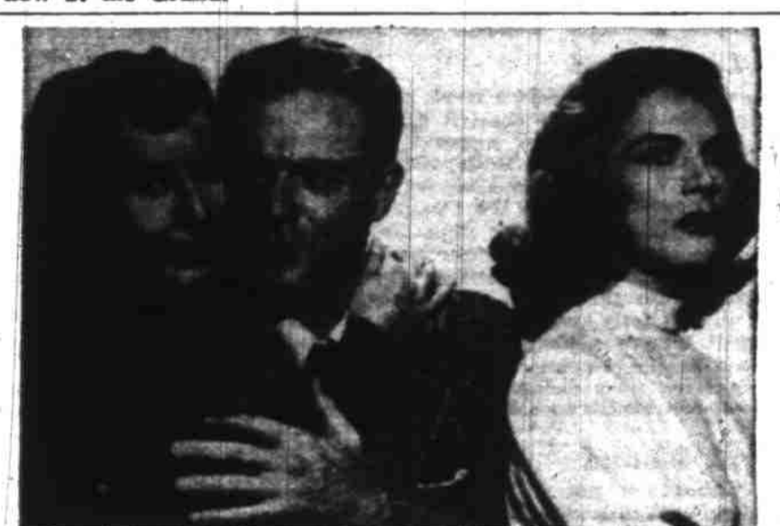
A tense scene from "The Strange Love of Martha Ivers," which starts today at Warner's Elsinore theatre, starring Barbara Stanwyck, Van Heflin and Elizabeth Scott.