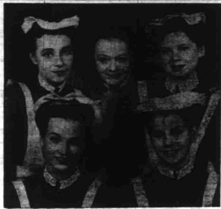
The five maids appearing in the stage play "Life With Father," which will be in Salem Tuesday night, November 5, under the sponsorship of the Salem Rotary club scholarship committee.

Twelve major airlines in the U. S. now are operating planes for freight-carrying only.