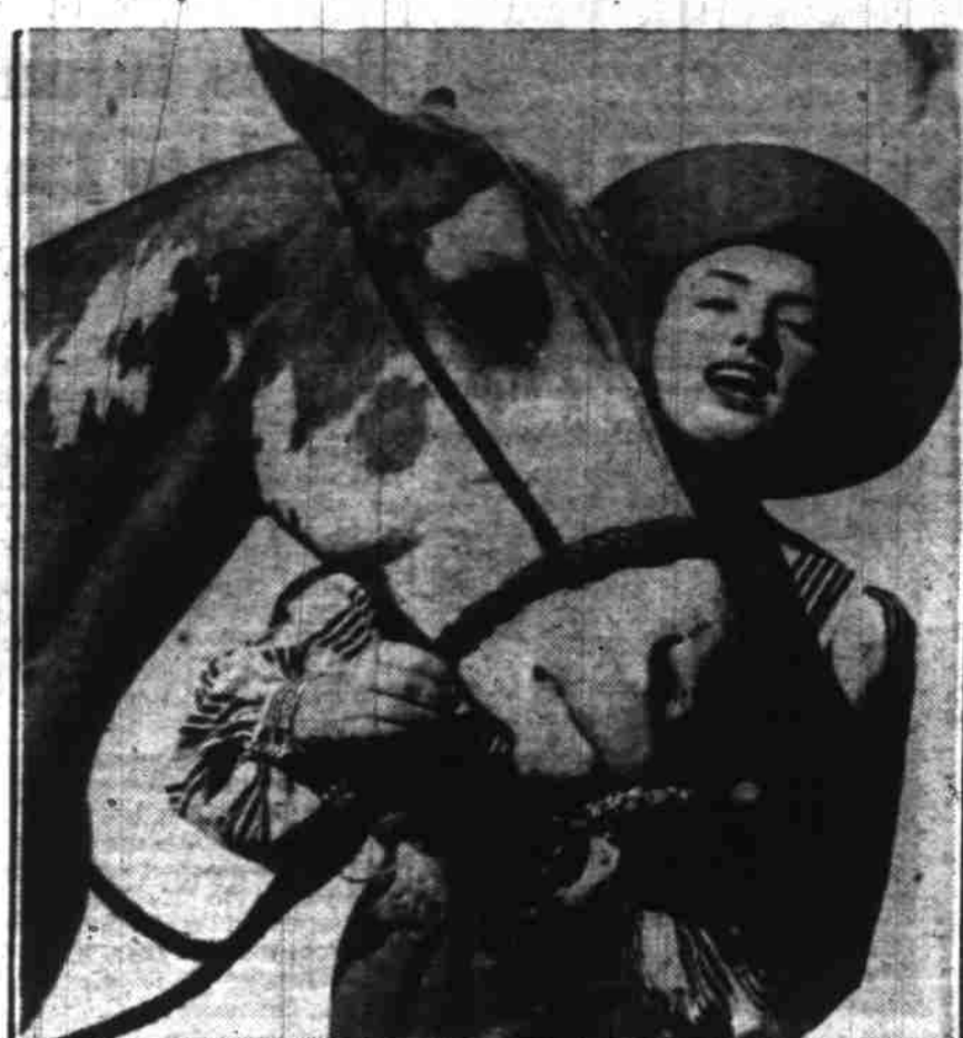
Lovely Australian actress Ann Richards turns completely American "native" with the crusading newspaper editor of early Oklahoma, co-starring with Randolph Scott and George "Gabby" Hayes in RKO Radio's romantic western adventure, "Badman's Territory," now at the Grand.

Clough-Barrick Co. Phone 9139 - 295 S. Church Salem, Ore.