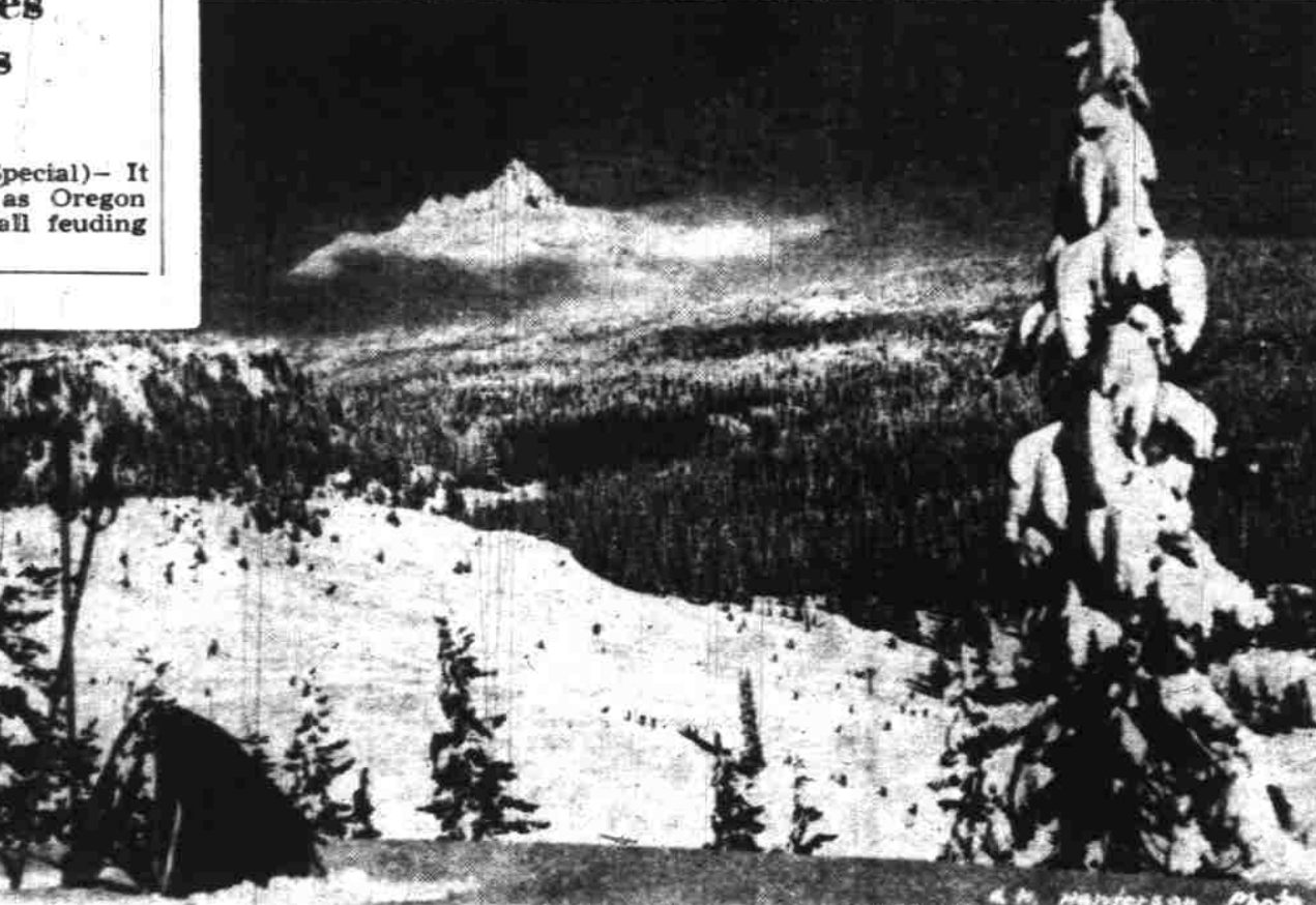
BIG SEASON: What with snow falling regularly in the mountains, Hoodoo Bowl near Santiam Lodge, pictured above with Three-fingered Jack in the background will soon be operating in what is expected to be the greatest ski season in its history.