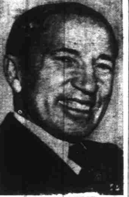
CARROLL REECE "Republicans assured."