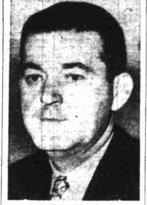
ROBERT HANNEGAN "Democrats confident."

LAKE SUCCESS, N. Y., Nov. 2.—(AP)—Despite strenuous efforts of Soviet Russia to block criticism of the United Nations security council, Egypt and Argentina today led a small-nations attack on the council for rejecting the applications of Ireland, Portugal, Transjordan, Albania and Outer Mongolia for UN membership.