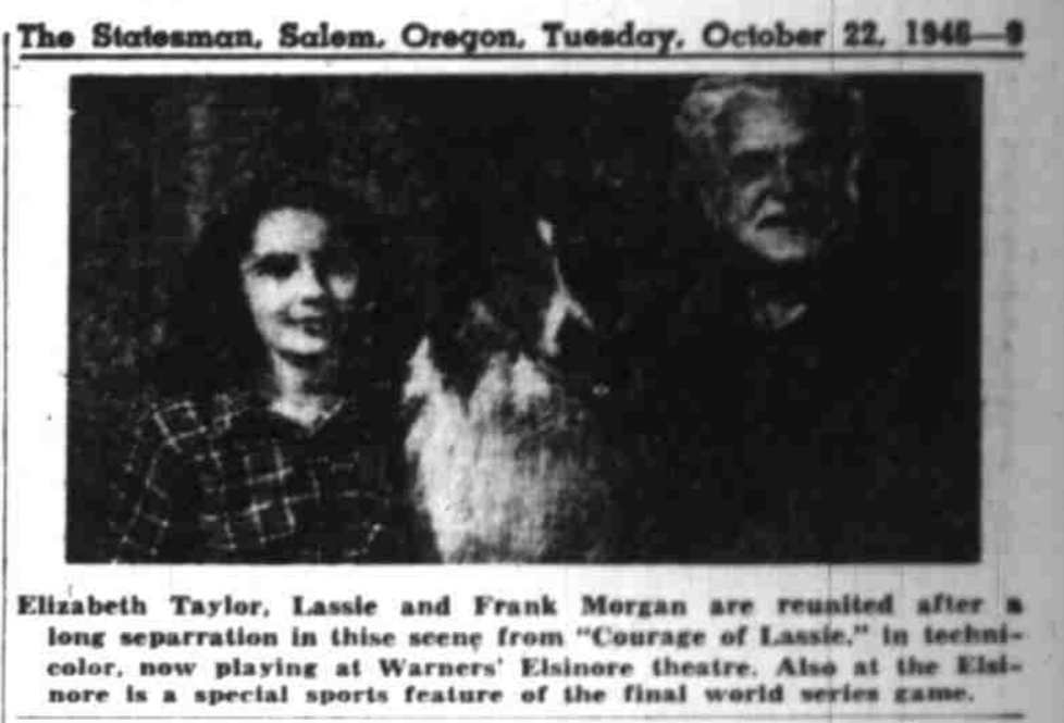
Elizabeth Taylor, Lassie and Frank Morgan are reunited after a long separation in this scene from "Courage of Lassie." In technicolor, now playing at Warners' Elsinore theatre. Also at the Elsinore is a special sports feature of the final world series game.