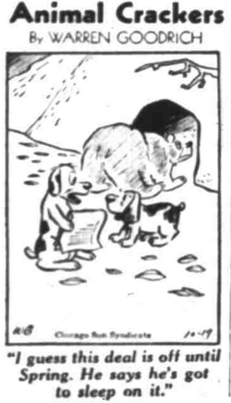
"I guess this deal is off until Spring. He says he's got to sleep on it."