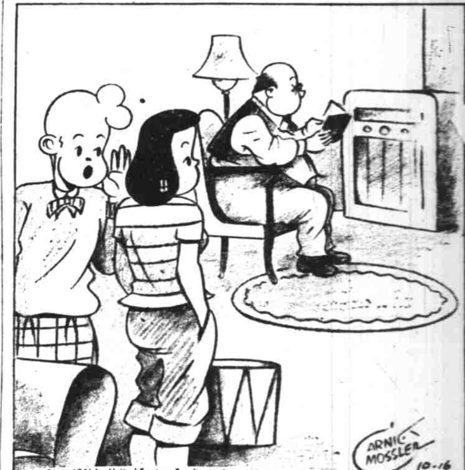
"I don't like to doubt pop's word, but do you think we ever really sat on his LAP and listened to bedtime stories?"