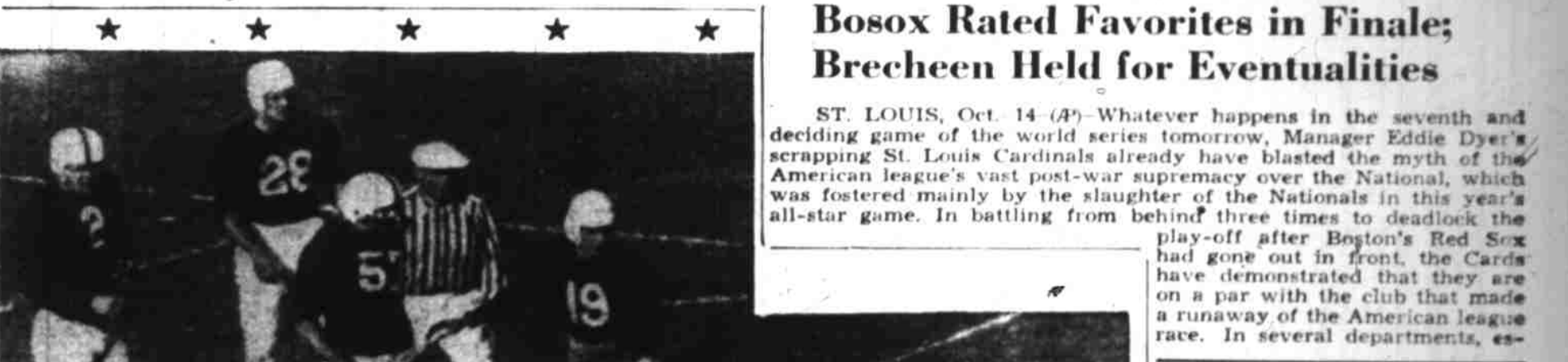
★ ★ ★ ★ ★ ★ ★ ★ ★ ★