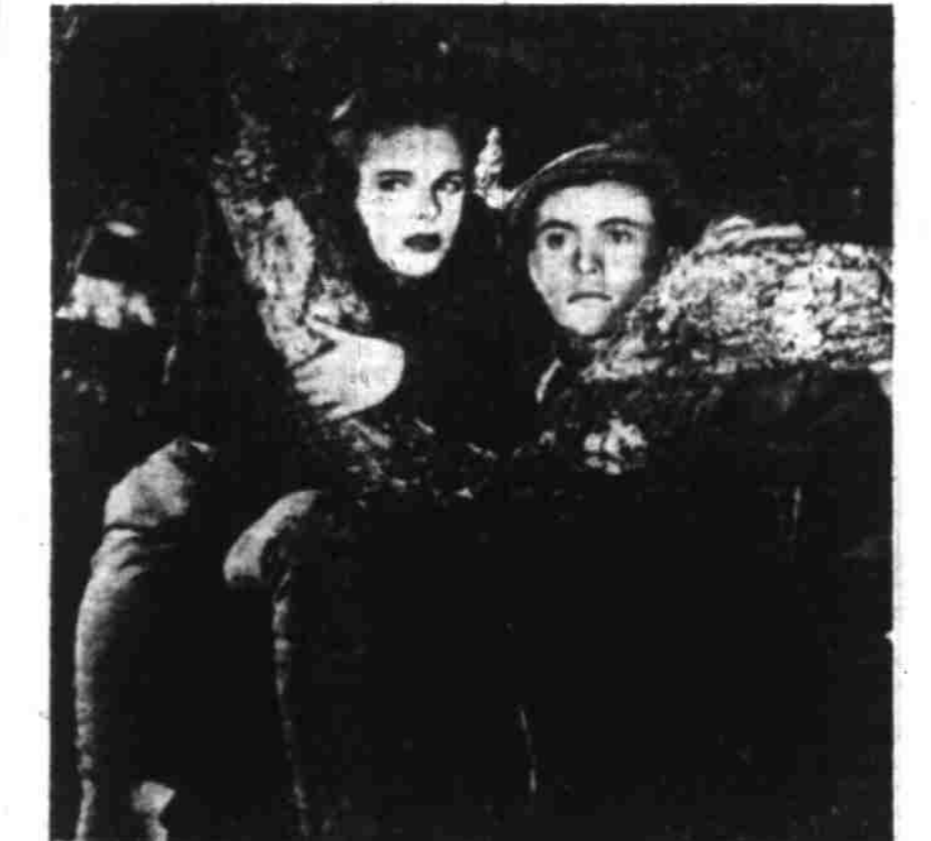
Mona Freeman and Terry Kiburn take to a tree in order to get a better view of the horse destined to play an important part in their lives in "Black Beauty," the filmization of the classic best-seller, which opens tomorrow at the Grand theatre. An Alson production directed by Max Nosseck, and released by 20th Century-Fox, "Black Beauty" also features Richard Denning, Evelyn Ankers, Charles Evans, J. M. Kerrigan and Moyna Margill.