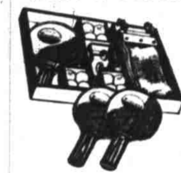
TABLE TENNIS SET 7.95 Official five-foot net, four paddles and 18 lively balls. Also book of rules.