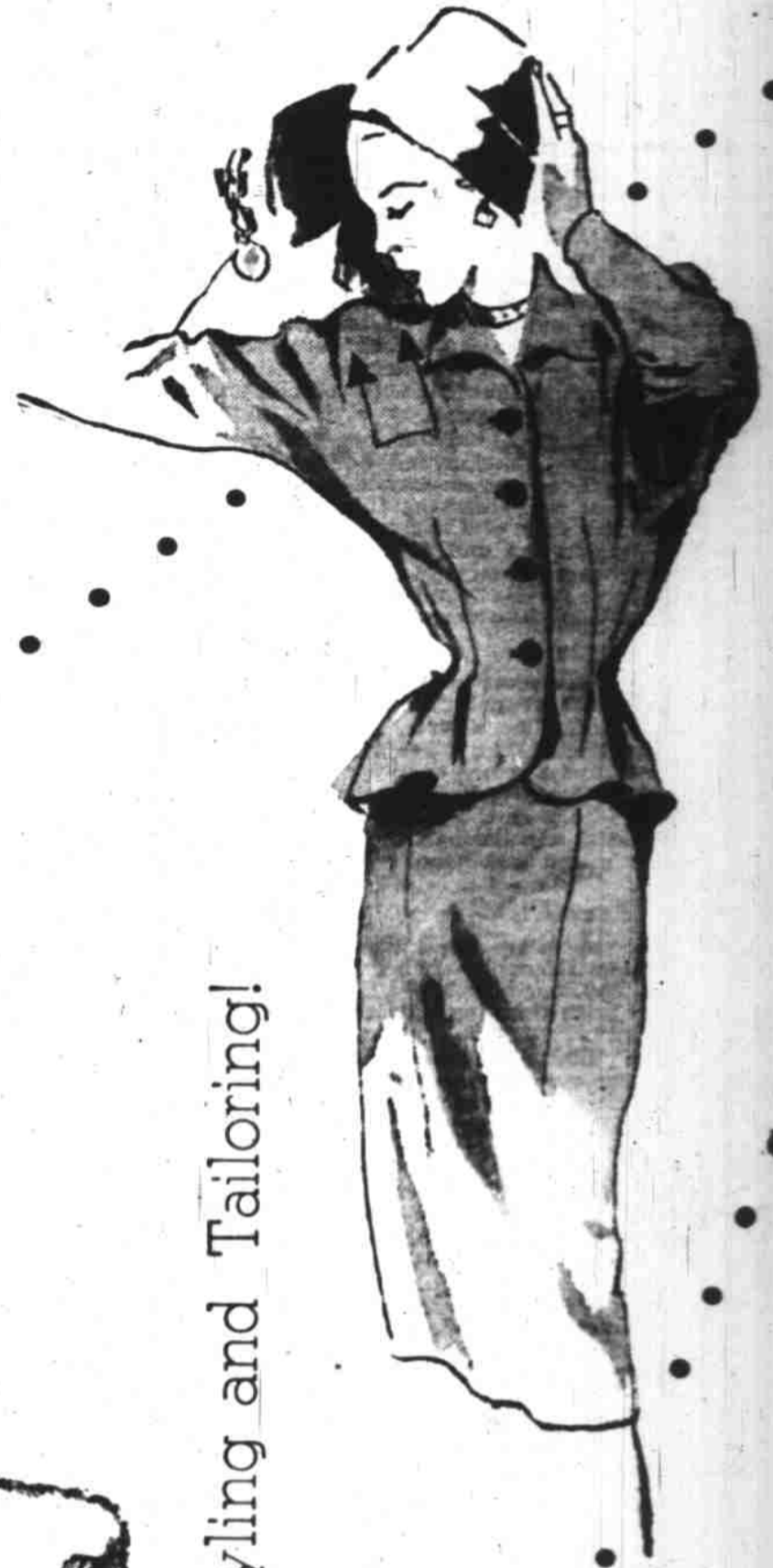
Superb Styling and Tailoring!

Here they are... at SALLY'S, and only at SALLY'S... such a magnificent array — such a grand assortment of newest sizes from 9 to 44, styles and shades in COATS and SUITS for Fall! Heavenly Fabrics in plaids, checks, stripes and pastels... colors both vibrant and supple... perfectly tailored by famous-name manufacturers! Fall Fashion eminence can be yours in a Coat or Suit from SALLY'S!